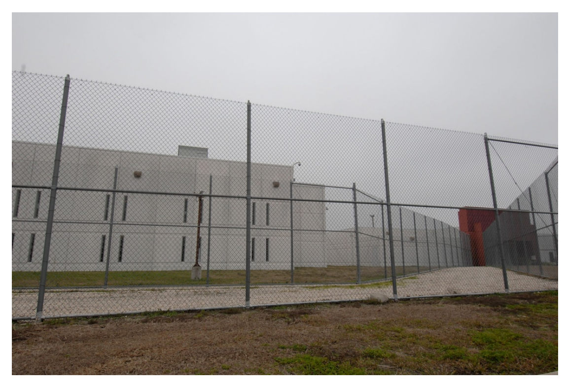
The privately operated T. Don Hutto detention center in Taylor, Texas, has long been entangled in

That warning was soon followed by dozens, and then hundreds, of abuse reports.