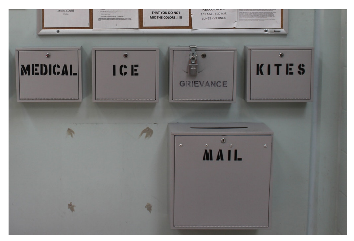
Detainees can leave anonymous complaints in locked mailboxes at the Adelanto ICE Processing Center in Adelanto, Calif., July 2016.

In another report, a detainee in Louisiana said she had asked staff for a grievance form, "which was given to her, but the staff refused to provide a pen or pencil to write it."