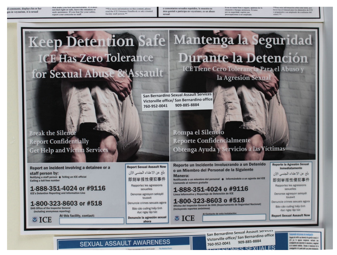
Flyers at the Adelanto ICE Processing Center in Adelanto, Calif., call on detainees to report sexual abuse, in July 2016.

ICE claimed that it investigates all complaints. Between 2012 and 2017, ICE found that only 160, or 12 percent, of complaints were "substantiated," while 793, or 59 percent, were "unsubstantiated," and 345, or 26 percent, were "unfounded." Three percent of investigations remained open, ICE said. The ICE spokesperson wrote in a statement that "it would be inappropriate to speculate about the reasons that claims are found to be unsubstantiated or unfounded." The internal ICE statistics, which were shared with The Intercept shortly before publication, are available here.